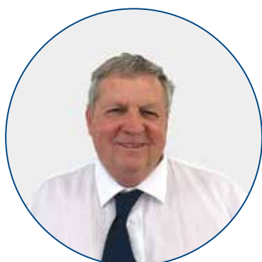
Craig Jepson Kaipara Mayor