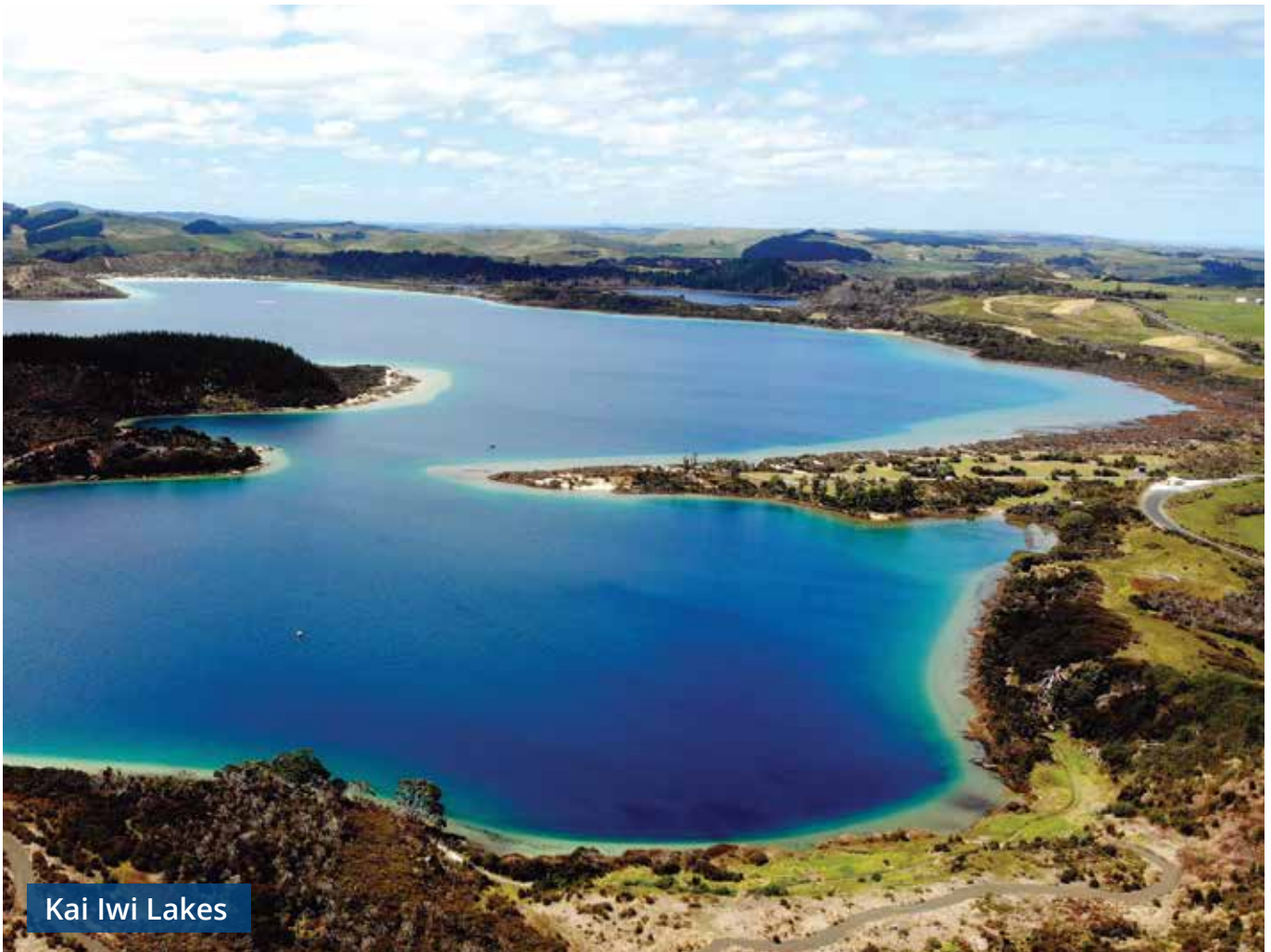
Kai Iwi Lakes

Please note: Numbers are rounded, a full breakdown can be found in Part Two of the full 2023/2024 Annual Report.